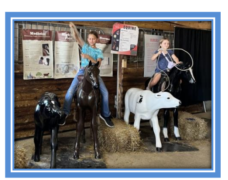
Rope a Calf